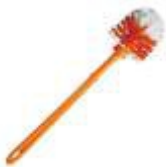
TOILET BRUSH ROUND C-523