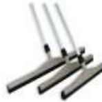
RUBBER HOLDER SQUEEZE 18"/22"/30" C-556/557/557A