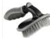
TYRE BRUSH C-545