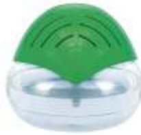
AIR REVITISOR (M) H-407