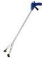
LEAF PICKER C-248