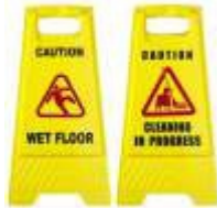
CAUTION SIGN BOARD C-208