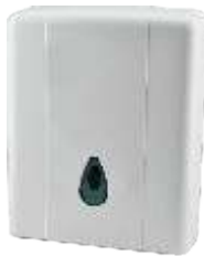
QUADRATE DISPENSER H-202