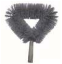
RINGED TUBE BRUSH C-240