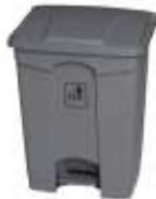
30/45/68/87 LTR PEDAL BIN D-221-224