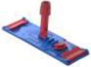
DRY MOP FRAME C-401A