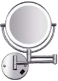
8" MAGNIFYING MIRROR H-409