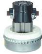
VACUUM MOTOR (AMETEK)