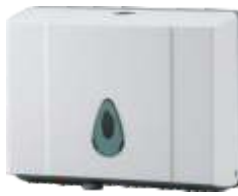
MINI QUADRATE DISPENSER H-205