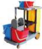
MULTIFUNCTION JANITORIAL CART C-103