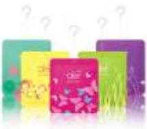
AER POCKET H-523