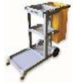
JANITORIAL CART C-104