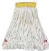
WET MOP REFILL LOOPED (350GMS) C-422C