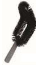
BENDED TUBE BRUSH C-239