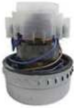
VACUUM MOTOR (WHITE)