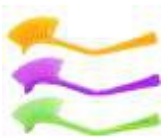
SINK BRUSH C-531