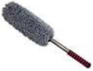
CAR DUSTER (ROUND) C-542