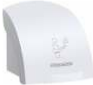
ABS HAND DRYER H-106