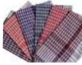
CHECK CLOTH C-321