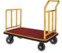
LUGGAGE TROLLEY (L) C-123