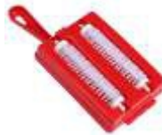
CARPET ROLLER C-549