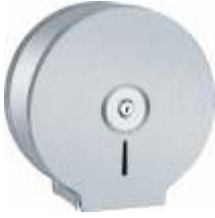
SS CIRCULAR DISPENSER H-207