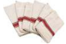
MOP CLOTH C-323