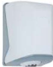
CENTRE PULL DISPENSER H-213