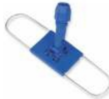
DUST MOP FRAME 18" C-408A