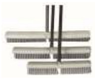
ROAD BRUSH 18"/24" (H) C-501/502