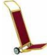
LUGGAGE TROLLEY (M) C-122