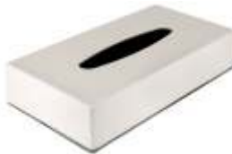
FLAT DISPENSER (M) H-216