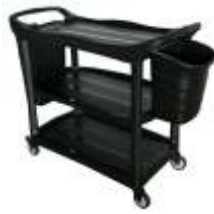
UTILITY CART (B) C-110