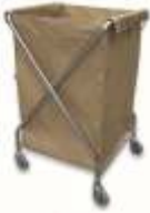
X SHAPE LAUNDRY CART (SS) C-105