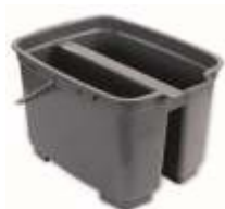
2 POCKET BUCKET C-113