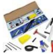
WINDOW CLEANING KIT C-212