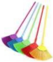
DAIMOND BRUSH C-509