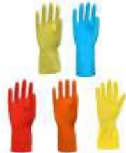
LATEX GLOVES C-325