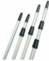
TELESCOPIC POLE (1.2/3.6 /6/8/11MTR) C-233-238