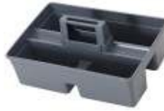
CADDY/TOOL BASKET C-201