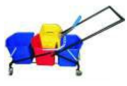
3 BUCKET TROLLEY C-119A