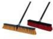
ROAD BRUSH 18" C-503