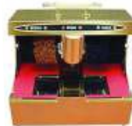
SOLE CLEANING MACHINE GOLD C-256