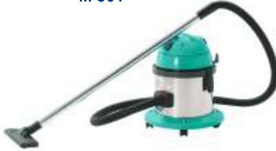
10 LTR (DRY) M-301