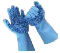
KITCHEN GLOVES C-325A