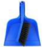
DUST PAN WITH BRUSH (H) C-520