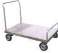
LUGGAGE TROLLEY (SS) (S) C-121