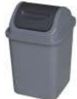
25/60 LTR SWING BIN D-227-228