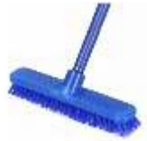
HARDY BRUSH C-507