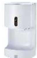
SANITISER (WALL MOUNTING) H-340