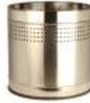
PLANTER (12 X 12/14X14) D-119/120