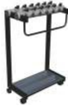
UMBRELLA HANGER (12"/18") C-130/130A