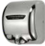
SS JET HAND DRYER H-102