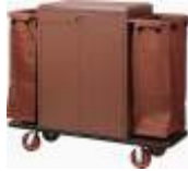
MULTIFUNCTION SERVICE CART (S) C-102