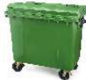
660 LTR DUSTBIN D-220