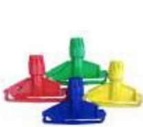
MOP CLIP C-417