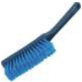
CARPET BRUSH (M) C-513A