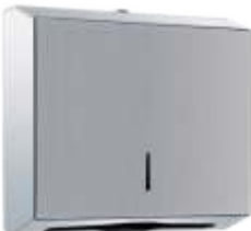
SS MINI QUADRATE DISPENSER H-204