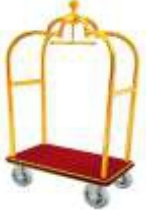
LUGGAGE TROLLEY (XL) C-124