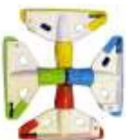
MOP CLIP C-421A