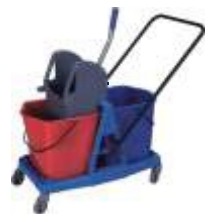
50 LTR WRINGER BUCKET C-117