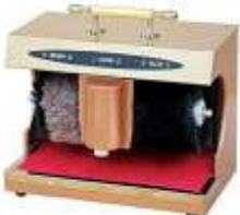
SHOE POLISH MACHINE (S/M) C-250/252