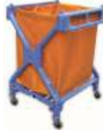
X SHAPE LAUNDRY CART (PLASTIC) C-107