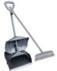
LOBBY DUST PAN (GREY) C-206