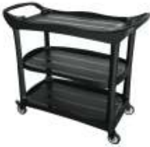
UTILITY CART (S) C-109