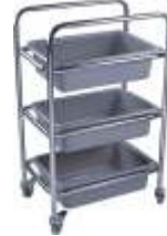
RESTAURANT TROLLEY (S) C-111