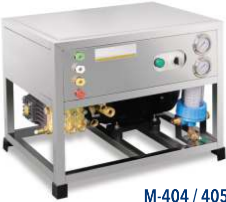
M-404 / 405