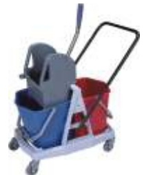
40 LTR WRINGER BUCKET C-116