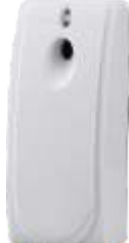
AUTOMATIC ROOM FRESHNER H-406