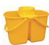
PORTABLE BUCKET C-114