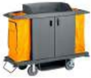
MULTIFUNCTION SERVICE CART C-101