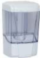
SOAP DISPENSER AUTOMATIC H-326