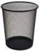
MESH BIN (SM/L) D-206-208