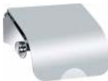
TISSUE PAPER HOLDER (SS) H-211