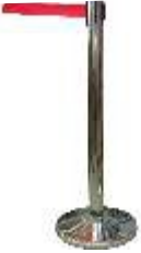
QUEUE MANAGER C-132