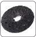
PAD HOLDER 20"