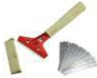
FLOOR SCRAPPER C-228