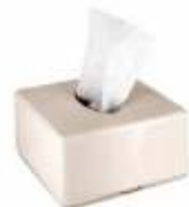
POP UP DISPENSER H-218