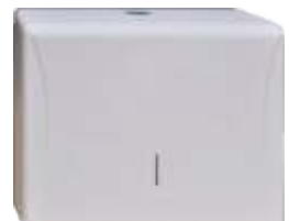
MINI QUADRATE DISPENSER H-206