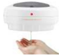
SOAP DISPENSER AUTOMATIC H-327