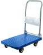
LUGGAGE TROLLEY (ABS) C-120