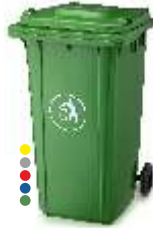
240 LTR DUSTBIN D-214-218