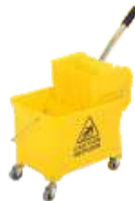
20LTR WRINGER BUCKET C-115