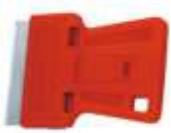
MINI POCKET SCRAPPER C-232