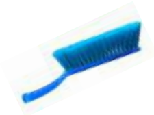
CARPET BRUSH (S) C-512