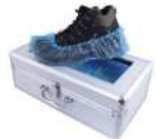
SHOE COVER DISPENSER C-258