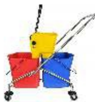
60 LTR WRINGER BUCKET C-118