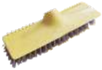
SCRUBBING BRUSH (H) C-508