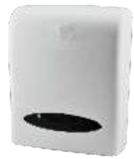
QUADRATE DISPENSER H-203