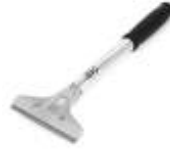
LONG HANDLE FLOOR SCRAPPER C-230