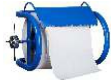
KITCHEN ROLL DISPENSER H-217