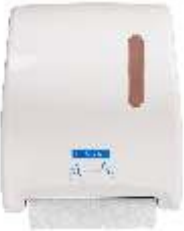
HRT AUTOCUT DISPENSER H-212