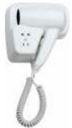
HAIR DRYER WITH SWITCH H-108