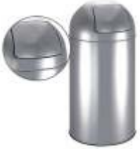
PUSH BIN (10 X 14/14 X 32) D-115/116