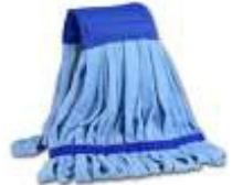
WET MOP REFILL MICROFIBER (300 GMS) C-424