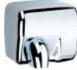
SS HAND DRYER (NOZZLE) H-103