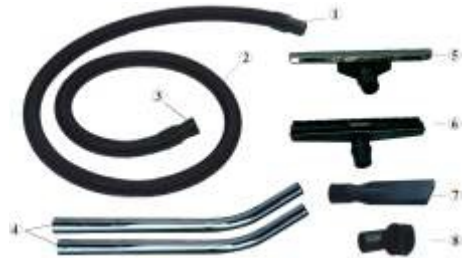
30/ 60/ 80 LTR ACCESSORIES