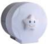
MINI CIRCULAR DISPENSER H-210