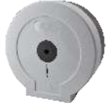
CIRCULAR DISPENSER H-209