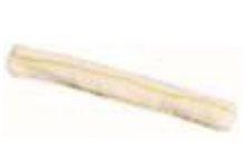
14"/16"/18" WASHER SLEEVES C-225-227