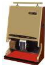
SHOE POLISH MACHINE (L) GOLD C-254