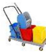
3 BUCKET TROLLEY C-119