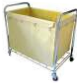
QUADRATE LAUNDRY CART (SS) C-106