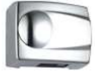
SS HAND DRYER (MINI) H-104