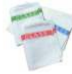
GLASS CLEANING CLOTH C-322