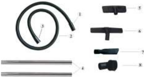
15 LTR ACCESSORIES