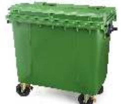
1100 LTR DUSTBIN D-220