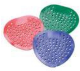
FLAT SCREEN H-519