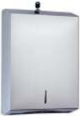
SS QUADRATE DISPENSER H-201