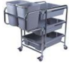
RESTAURANT TROLLEY (B) C-112