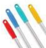
ALUMINIUM POLE C-425