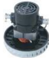
SINGLE STAGE MOTOR