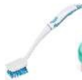
SINK BRUSH (H) C-532