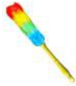
FEATHER DUSTER (M) C-538