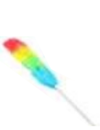
FEATHER DUSTER (S) C-537