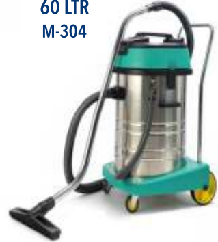
60 LTR M-304