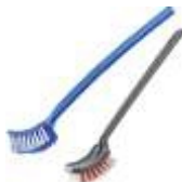
TOILET BRUSH SINGLE HOCKEY C-525