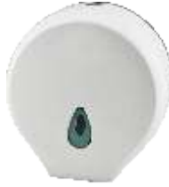
CIRCULAR DISPENSER H-208