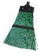
GARDEN BRUSH C-511