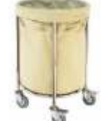
LAUNDRY CART (ROUND) C-108