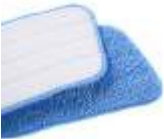
ALUMINIUM DRY MOP REFILL - 18" (VELCRO) C-406