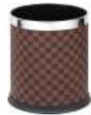
COATED DUSTBIN MESH BIN (S) D-205