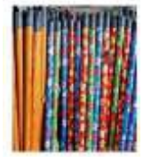
WOODEN STICK C-435