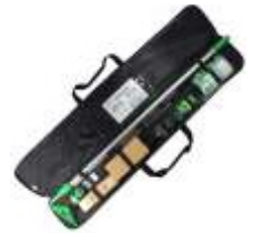
WINDOW KIT BAG C-213