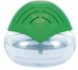
AIR REVITALISOR (B) H-408