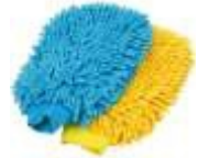
HAND GLOVES (MICROFIBRE) C-550